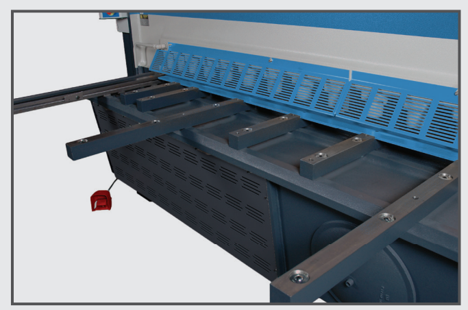
Squaring arms and front support arms with or without scale, T-slots and tilting stop. Lengths from 1000 up to 3000mm.