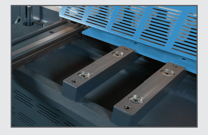
Ball transfers mounted in the iron table blocks, for easy feed-in of the sheets.