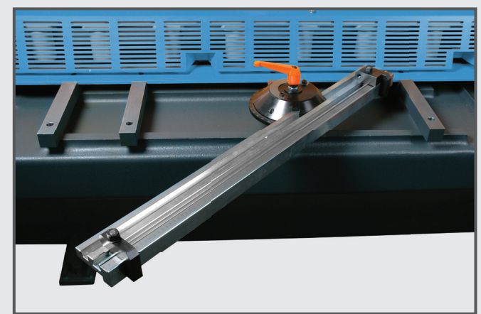
Protractor for Angle Shearing.