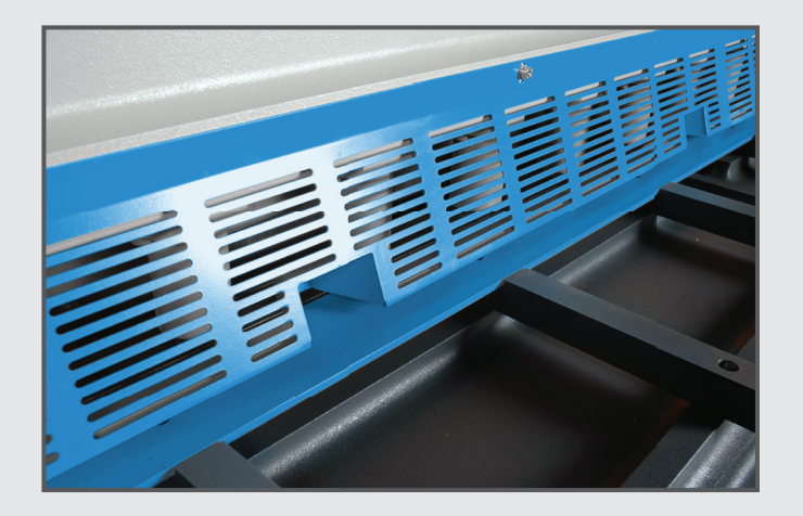
Hand safety guard with hand gaps for handling small sheets.